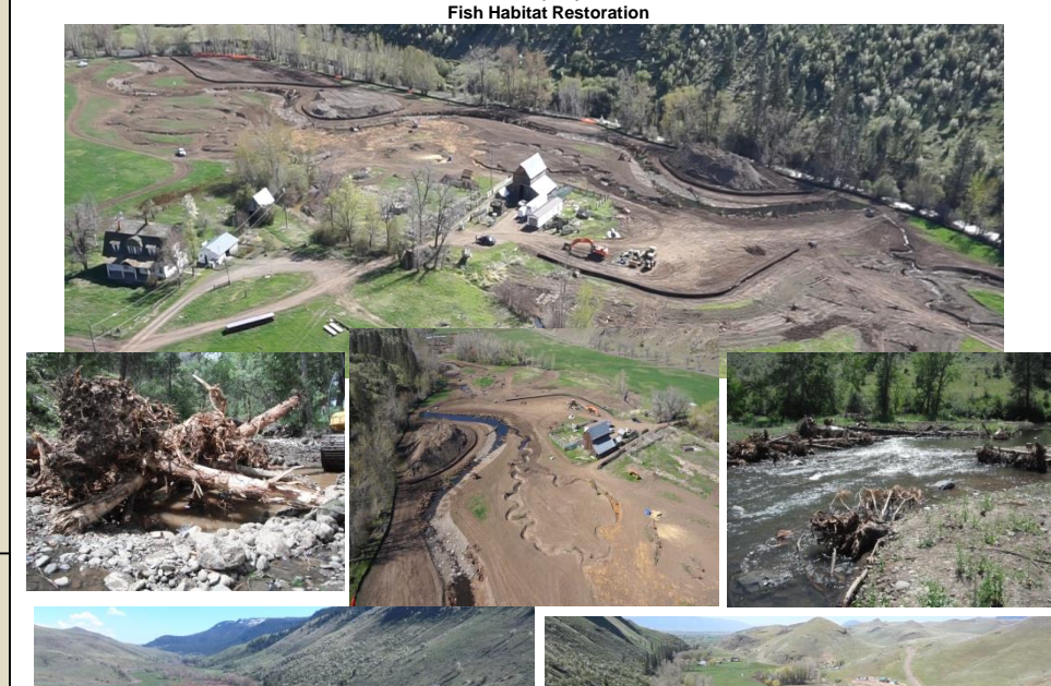
Catherine Creek, RM 44, Southern Cross Conservation Property